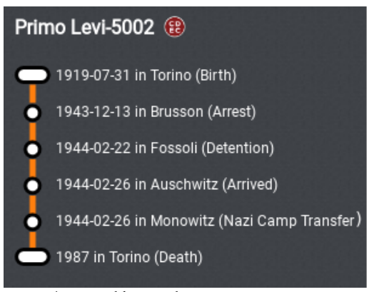
Figure 4: Metro-like visualization