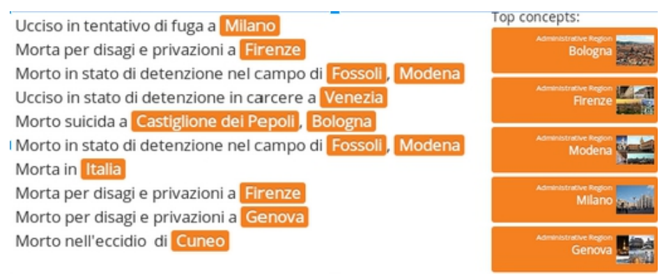
Figure 2: Example of output of the Wiki Machine

In case the place_of_death property had no value, we automatically extracted the places mentioned in the free-text descriptions of the field deathDescriptionIntegration. This was performed using The Wiki Machine 11., a system that links the concepts mentioned in a document to the corresponding Wikipedia page describing them. By selecting only the pages referring to a place, we automatically identified geographical mentions. For instance, giving as input the sentence "Ucciso in tentativo di fuga a Milano"/ Killed in an attempt to escape in Milan , the tool links "Milano" to the corresponding Wikipedia page, and annotates the word as a location, more specifically as an administrative region, as shown in Figure 2.